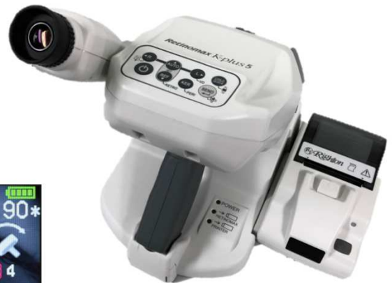
Standard Set (Main Unit, Station, Printer)