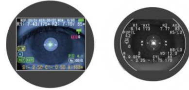
Retinomax 5 Retinomax 3 Comparison view of the same eye point

Eye piece relief is 48mm from 32.2mm so that enable to look inside image while even looking at outside. No need to stick eye to the eyepiece all the time.